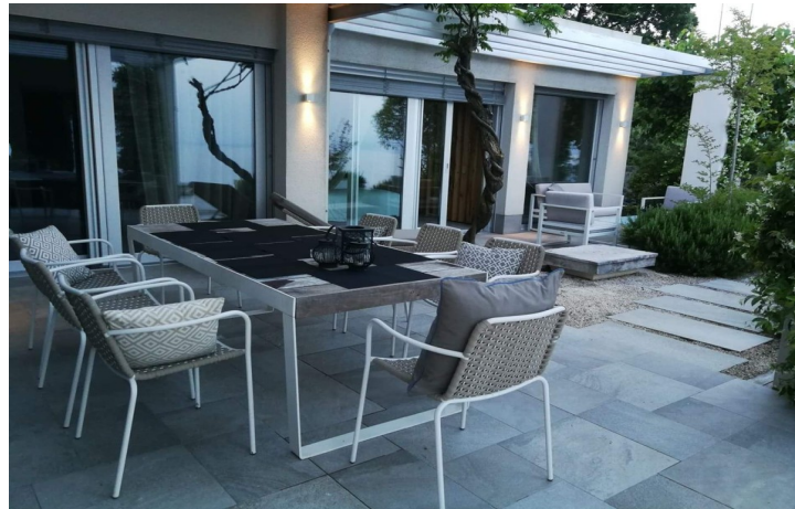
Infinity pool with the panoramic sea view