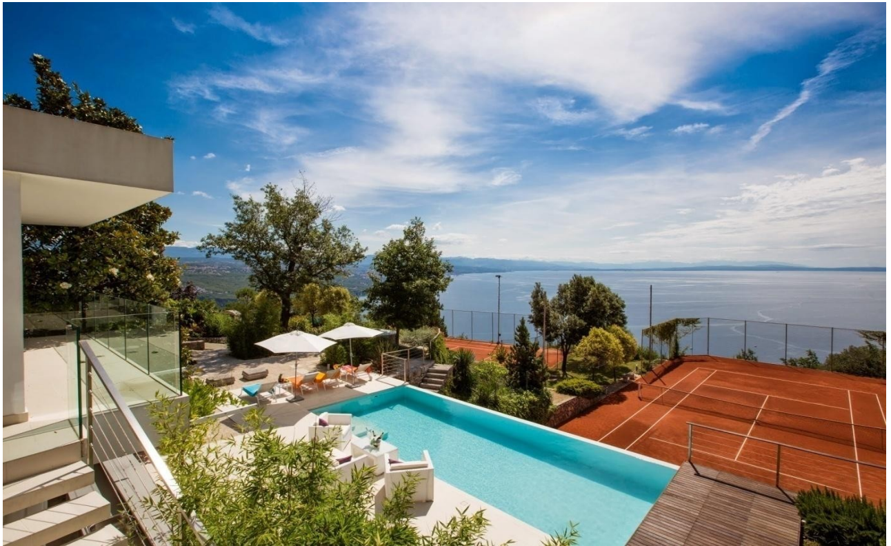
Villa – Private Outdoor area