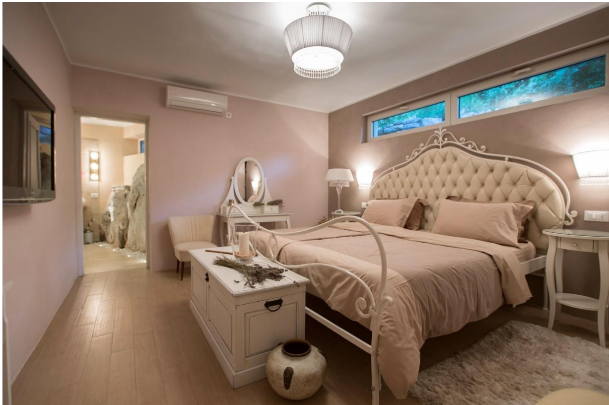
Bedroom with en-suite bathroom