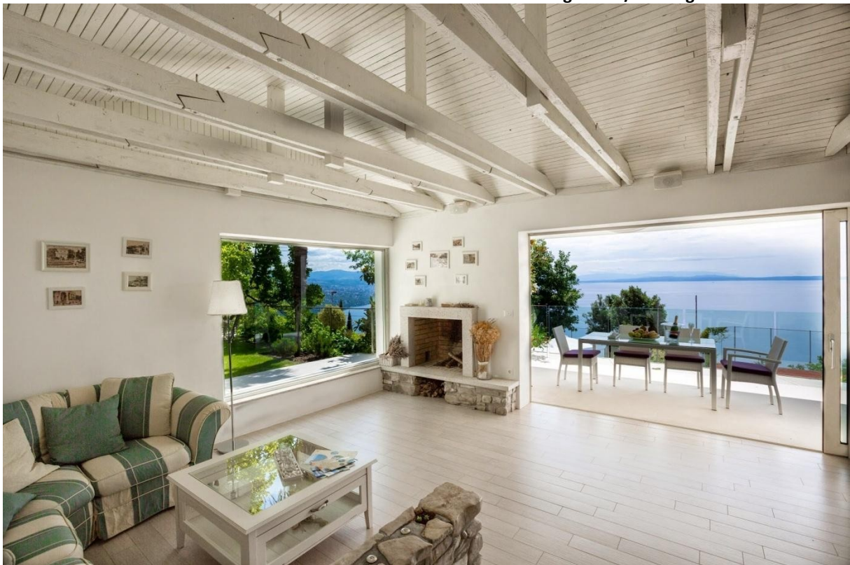
*Villa - Lounge area / dining room and terrace

Opatija Hills estate offers additional luxury accommodation possibilities always having in mind the privacy and tranquility our guests deserve. Choose to spend your holiday in our Resort, indulge yourself and experience the rich gastronomic and tourist offer of this beautiful Opatija Riviera region. Designed to capture the luxury of time and space with its unique and personalized service to guest preferences and privacy, Opatija Hills is the perfect getaway for a family adventure, private wedding, honeymoon oasis.... a secluded holiday of a lifetime.